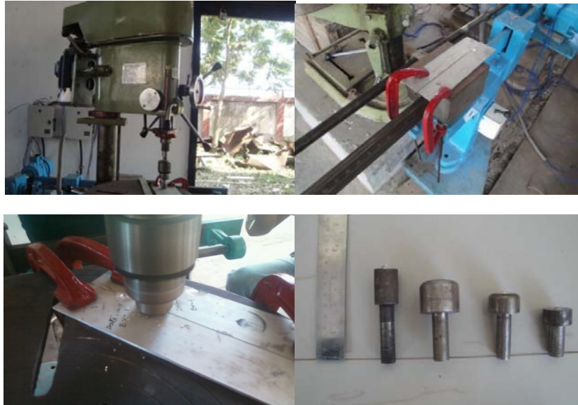
Fig. 2 – Pillar friction stir welding Machine.