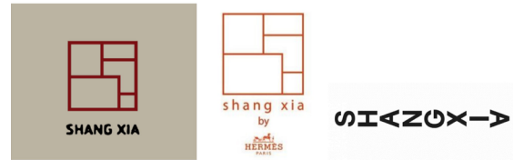
» Figure 4: Shang Xia logo evolution

The examination of luxury Chinese domestic brands Shanghai Tang (Fig. 3) and Shang Xia (Fig. 4) reveals a trend of simplicity in brand logo design. Shanghai Tang has undergone a shift from a highly decorative and complex logo formation to a simple black and white design featuring only Chinese and English characters. In contrast, Shang Xia has adopted a more modern and minimal style, with a transition from a calligraphic touch to a machine-written typeface. Both brand logos are presented in simple black and white, a universally accepted visual cue that signifies premium and luxurious characteristics (Wang et al., 2022). It is noteworthy that the inclusion of alphabetical letters as a main component in the brand logo design can be attributed to the findings of a study conducted by Lu (2010), which suggests that Chinese consumers tend to view brands with names written in alphabetical (roman) letters as more luxurious.