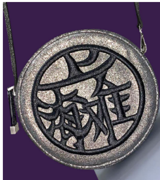
» Figure 5: Shanghai Tang Motif

As a brand that emphasizes modernity and craftsmanship, it rebranded in 2021 in order to appeal to the Generation Z demographic. The direct Chinese visual elements, such as the seal-looking logo and calligraphic implications in typography, have been removed (Figure 4).