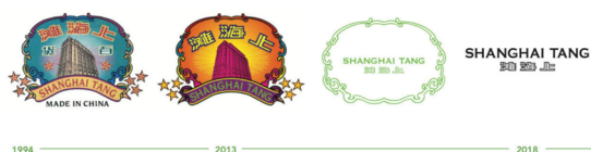
» Figure 3: Shanghai Tang logo evolution

The majority of luxury fashion brands are western, therefore, the logo often involves alphabetical characters, such as Burberry, Chanel, and Gucci. Some luxury fashion brands include symbols in their brand identity, such as Versace and Hermès. However, the recent rebranding trends in the luxury fashion industry indicate that simplicity is key (Loureiro, Jiménez-Barreto & Romero, 2020; Lypert, 2020; Wiley & Rapp, 2019), for example in the rebranding of Burberry and YSL.